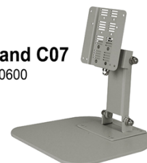
Free Stand C07 SKU-03620600