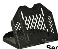
Secure Stand V07 SKU-03620610