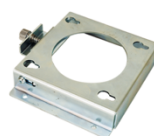
In Wall WK01 SKU-03620580