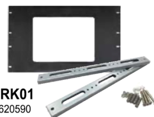
Rack RK01 SKU-03620590